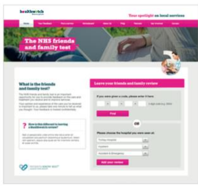
FFT Healthwatch form